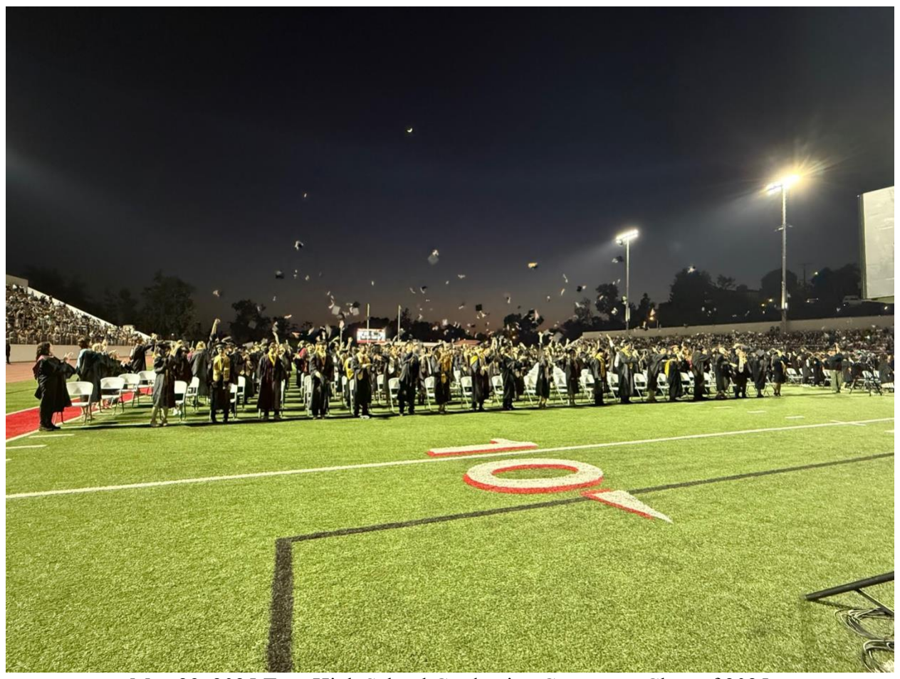
May 29, 2025 Troy High School Graduation Ceremony-Class of 2025