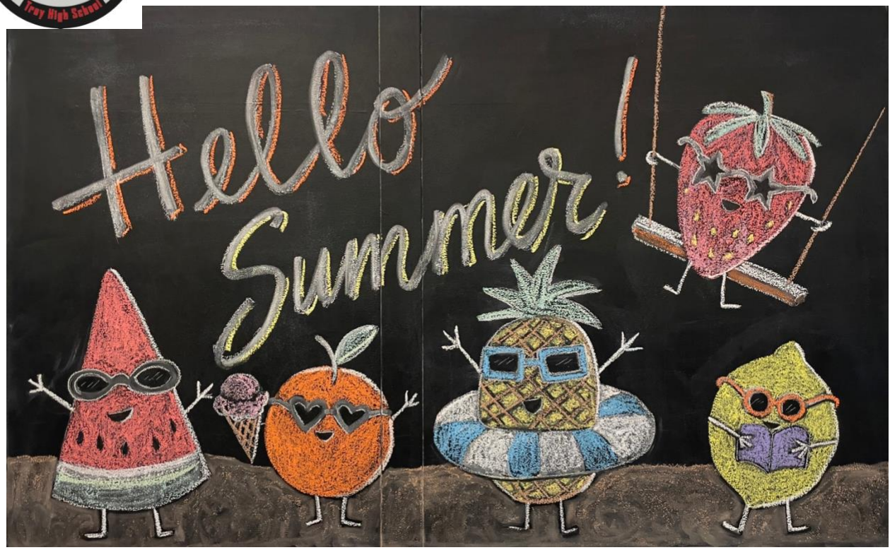
May 30, 2025